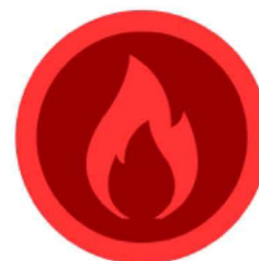
EMBER Senior Level 3 4 Hours/Week