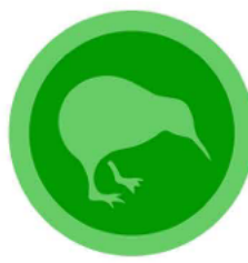
LADY FERNS IO5 6 Hours/Week