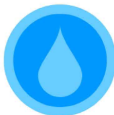
H2O Junior Level 2 4 Hours/Week