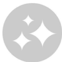
SPARKLE Mini Novice 2.5 Hours/Week