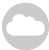
DREAM Youth Novice 3 Hours/Week