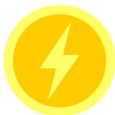
LIGHTNING Junior Level 1 4 Hours/Week