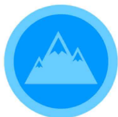
RANGERS IASF U16 Level 2 2 Hours/Week